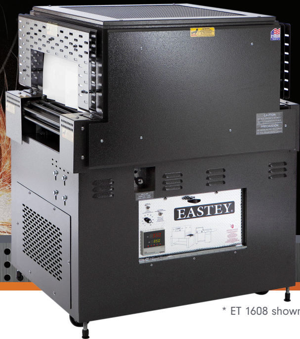
* ET 1608 shown