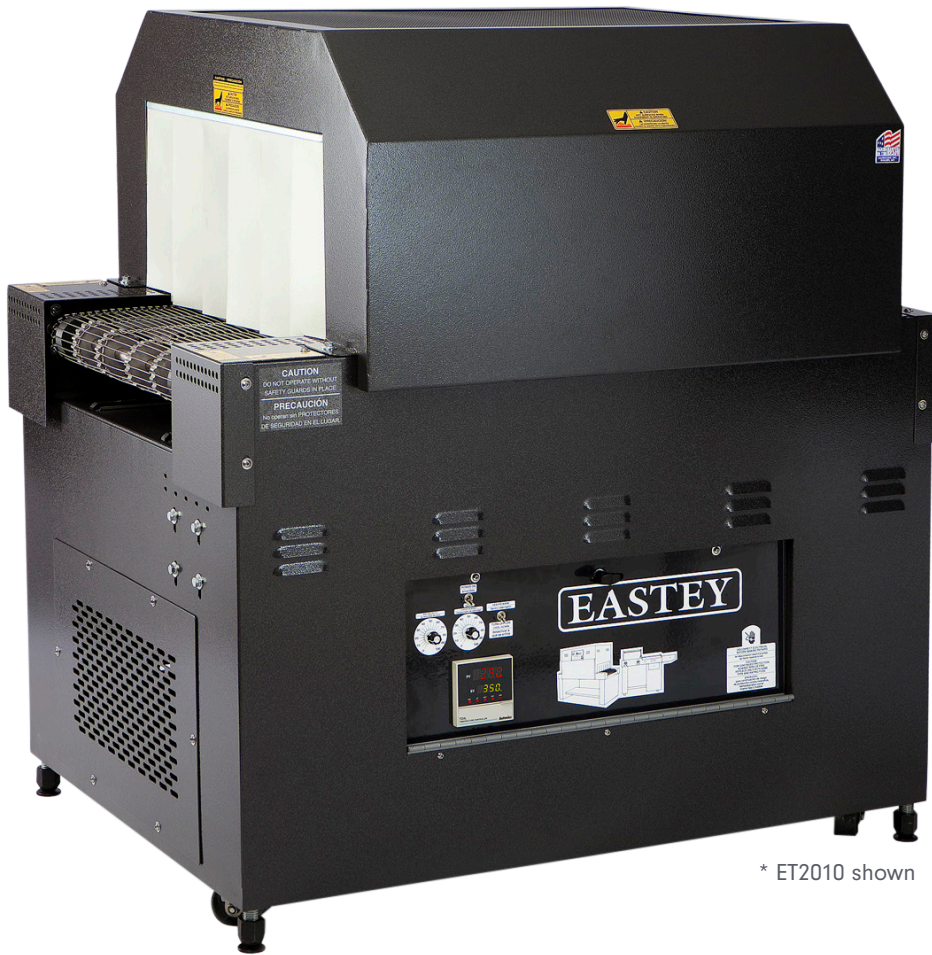
* ET2010 shown